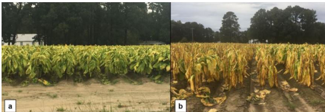
Figure 2—Leaf response to Hurricane Florence over a 72-hour period; a) Saturday, September 15th; and b) Tuesday, September 18th.