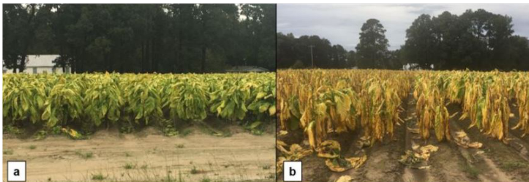
Figure 2—Leaf response to Hurricane Florence over a 72-hour period; a) Saturday, September 15th; and b) Tuesday, September 18th.