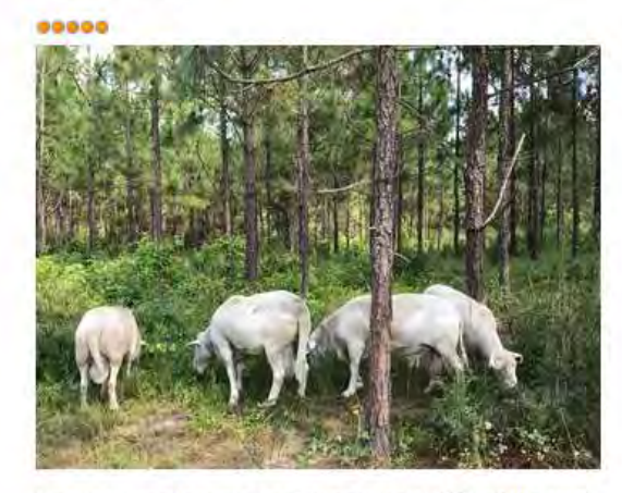
Non-industrial private landowners hold 87% of the total

Avenues for Woodland Management: Maximizing Benefits by Cutting Non-Target Plants and Rotational Grazing