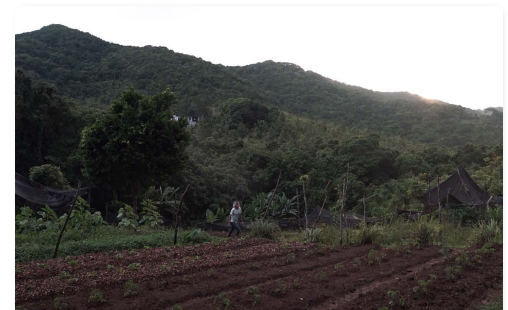
Siembra Tres Vidas Farm in Aibonito, Puerto Rico.

**The Caribbean region is becoming hotter and drier due to climate change. Climatic projections indicate that temperatures in the region will continue to rise, with some studies projecting a 1.5°F to 4°F increase in average annual temperatures for the U.S. Caribbean by 2050 (Henareh et al. 2016). Rainfall patterns will change, making more extreme rain events occur in the rainy season and the dry season more extensive .